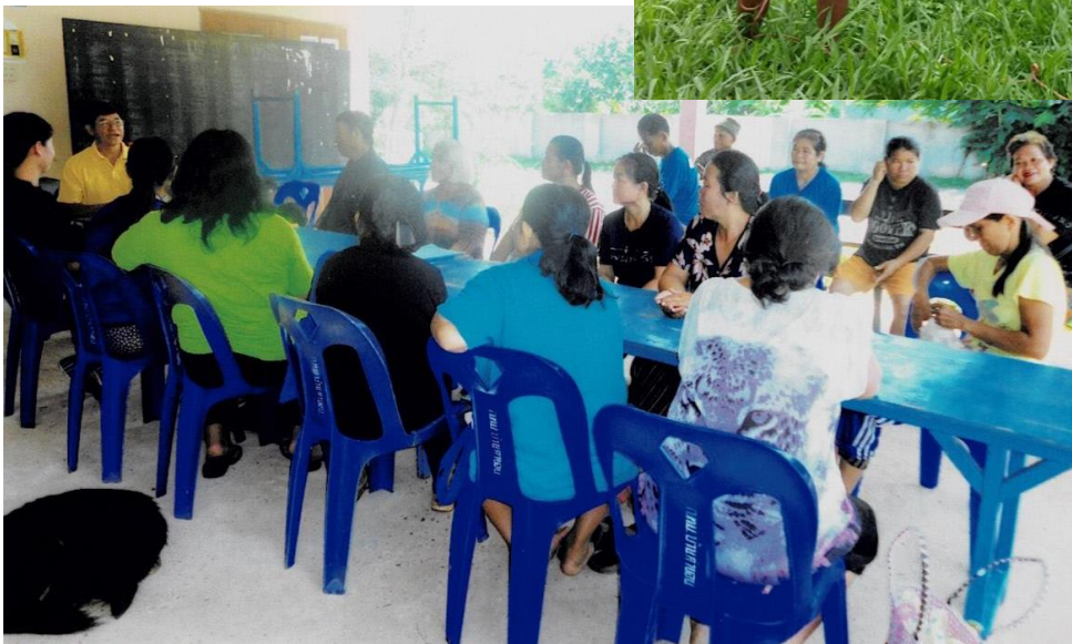
VVTC staff held a meeting with members of cow bank groups from Ban Khambon, Ban RongNo and Ban Non Rungruang, to follow up the progress of their activities.

3.5 Self-Help Animal Medicine Groups are now established in nine villages. They provide vaccinations in order to prevent foot and mouth disease to cattle as well as anthelmintic to cows of members and their neighbours who have cows living nearby.