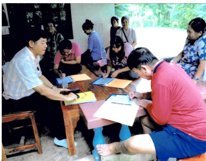
Signing contracts and agreements before giving cows to members generation 37/2061 Ban Rongno.