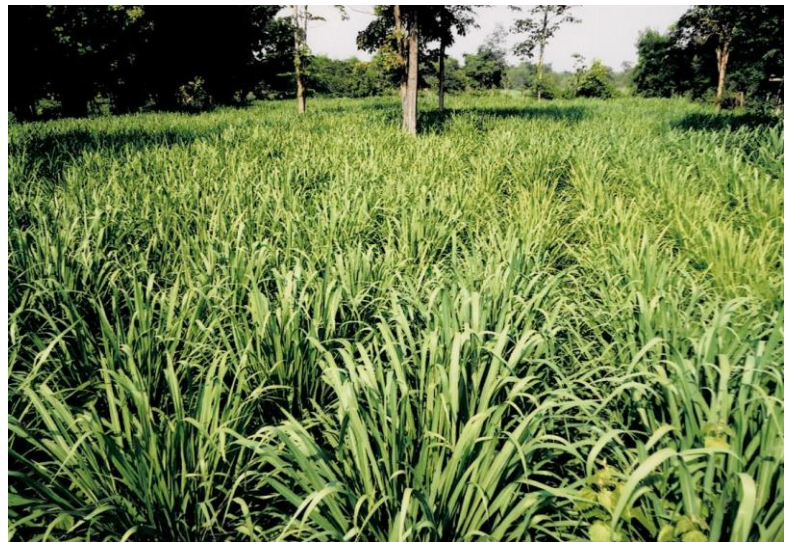
Left: Collected Manure for grass fields in Huai Sai Above: Purple guinea grass growing beautifully at Huai Sai Cow Bank

Outcome from farm management throughout the year: