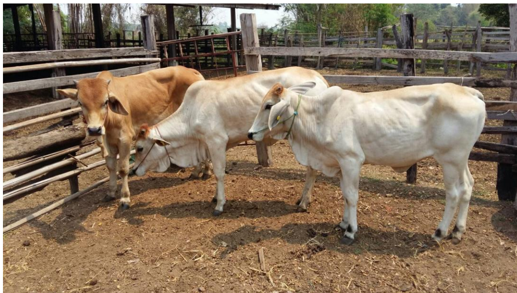
Yearlings shared by members with VVTC

For this period of reporting, the VVTC received 29 calves from cow bank members (12 female and 17 male) while the members of the cow bank kept 32 cows and calves altogether.